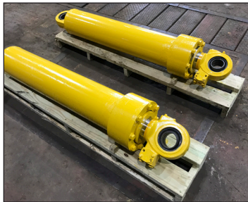
Rebuilt Komatsu HD785-7 Hoist cylinders (Qty. 2)

Contact us today at 218-471-2200 or miningsolutions@rmseq.com for parts availability.