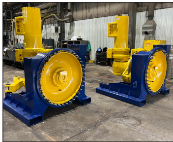
Rebuilt Komatsu 830E-1AC Front corners (Qty. 4)