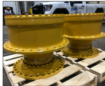
Rebuilt Caterpillar D9T Finals (Qty. 2)