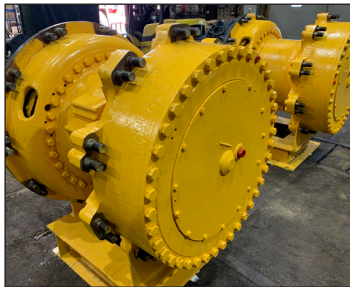
Rebuilt Komatsu HD785-7 Final drives (Qty. 2)