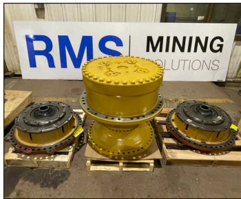
Rebuilt Caterpillar D11T Final and 2 steering clutches