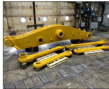
Rebuilt Caterpillar 992K Boom assy