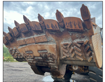
Used Caterpillar 992G Spade nose bucket with teeth